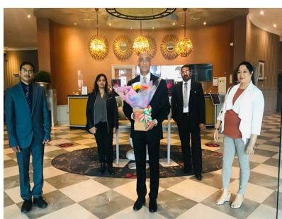
Ambassador with representatives of Indian community in Co. Laois