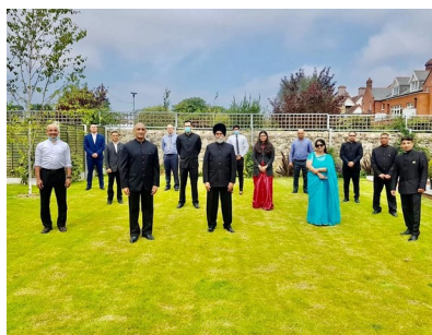
Ambassador with staff members