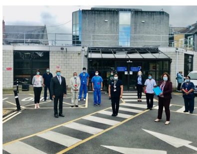
With front-line health workers at Our Lady's Hospital in Co. Meath