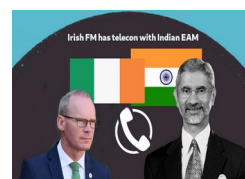
Irish Foreign Minister, Mr. Simon Coveney spoke on telephone with Indian External Affairs Minister, Dr. S. Jaishankar

4. Irish FM has telecon with Indian EAM: Subsequent to election of both India and Ireland as non-permanent members of UNSC for 2021-22, Irish Foreign Minister, Mr. Simon Coveney, and Indian External Affairs Minister, Dr. S. Jaishankar, spoke on telephone (04 Aug). They committed to work together to take forward our common priorities of multi-lateralism, climate change, rule-based international order/post-covid, peacekeeping and security.