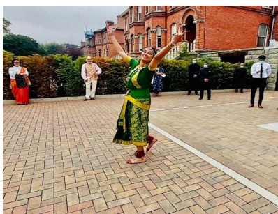
Celebration of 74th Independence Day - dance performance

2. Celebration of 74th Independence Day (ID) of India: On account of unprecedented circumstances of Covid-19, the 74 th ID was mainly celebrated on virtual platforms. The week-long on-line events included children's national costume competition; original regional language short poem competition dedicated to India's Independence; home-made face covering design competition with theme of self-reliance from home (Atamnirbhar); an expert panel discussion with Indian CEOs on "Post-Covid India-Ireland Economic Collaboration"; and posting of a video-collage with messages from the Indian community on the importance of ID. The main flag-hoisting event, in keeping with health restrictions, was attended by a limited number of participants, including Dublin Community Support Group members, women, youth and business representatives, as well as winners of Embassy on-line yoga quiz and blog competitions. Programme included a spot quiz on India-Ireland relations. The live-streamed event was joined by more than 18K viewers from Ireland, India and other countries.